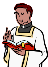
From The Pastor